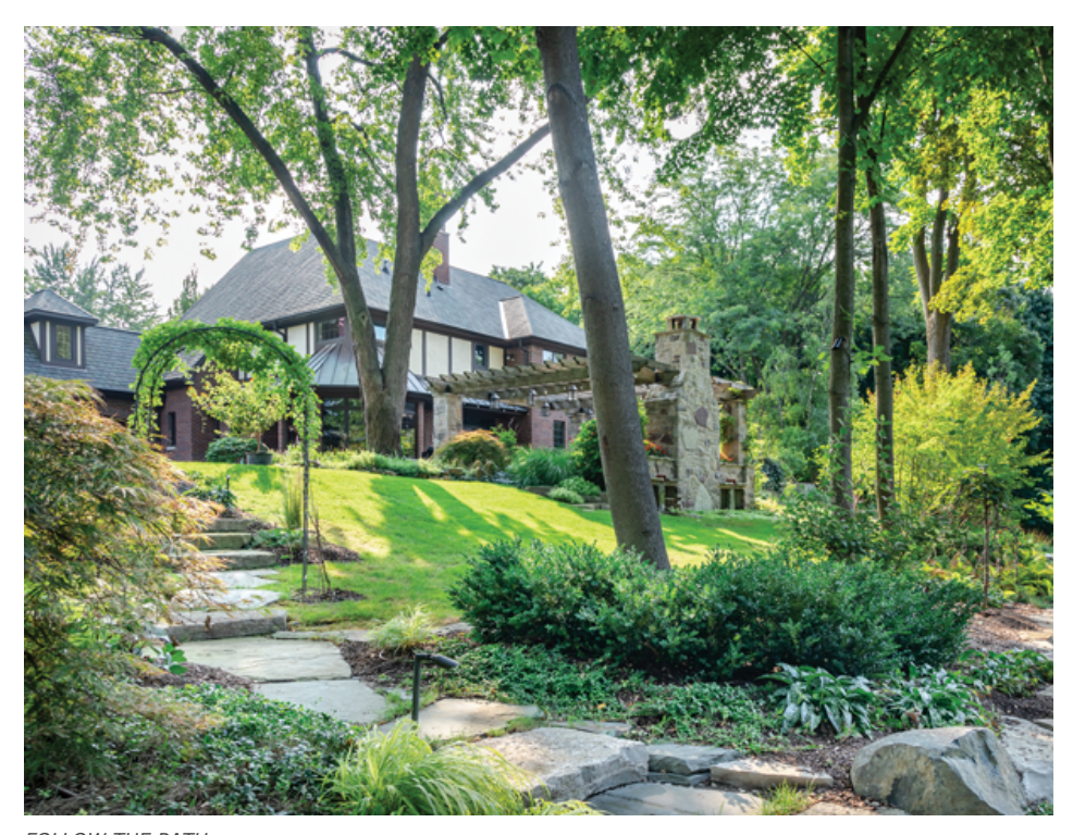
FOLLOW THE PATH Landscape architect Amy Schimmel Bessolo calls the verdant gardens and their variety of eye candy "an oa outside world."

The landscaper says selecting the right materials proved to be one of her biggest challenges, as each iter local deer population. Today, the gardens bloom with more than 25 different perennial varieties including bluebells, ferns, brunnera, pulmonaria, iris, and Japanese forest grass.